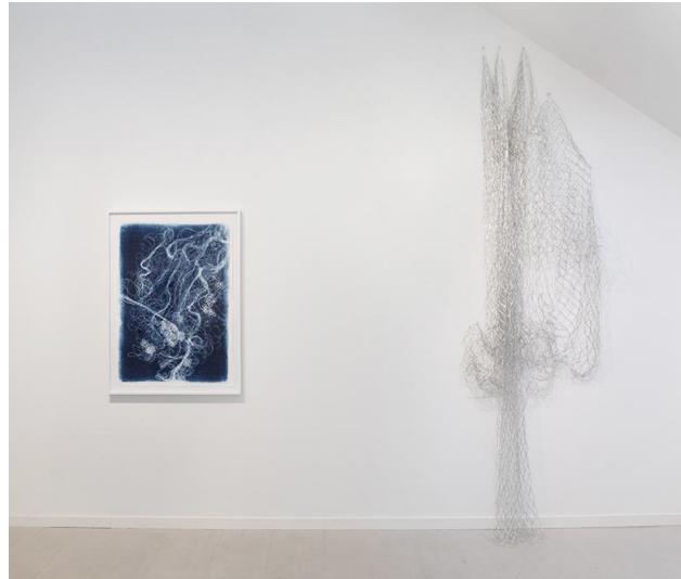
Above: Installation with Monoprint 1 , 2023 and Net , 2023 Left: Ghost Net , 2022, unique screenprint on paper, 60 x 44 in.

Hope's interest in seine netting as a sculptural medium was prompted by a 2019 visit to Maputo, Mozambique for an Art in Embassies commission. Mesmerized by heaps of discarded fishing nets strewn on the beach across from the U.S. Embassy and inspired by their resonance, she soon embarked on planning Murmuration 1 , an undulating wall sculpture comprising monofilament netting and masses of Modello can tabs. In 2022, a related large-scale work was exhibited at The Church in Sag Harbor. Last summer netting took on a buoyant and more visible role in an outdoor project sponsored by Guild Hall Museum at the site of the historic Amagansett Life-Saving Station. Ghost Net (2022), the five-foot tall silkscreen at The Drawing Room serves as a poignant two-dimensional evocation of that ephemeral installation.